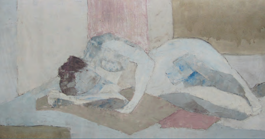
Ann Peterson, Untitled , late 1950s, private collection.